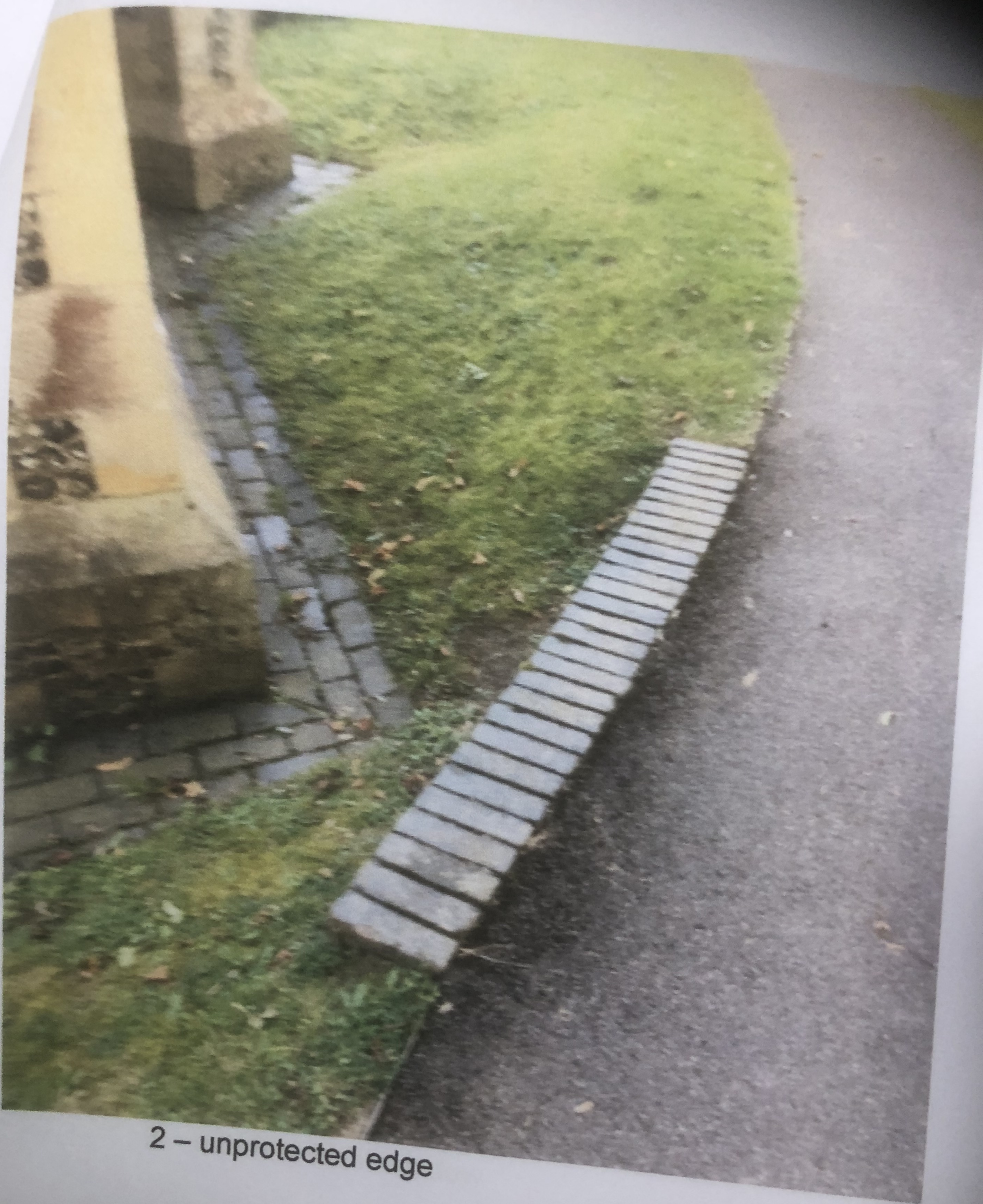
2 – unprotected edge